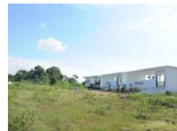
Sheep Market Yard- Siddipet, Medak