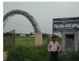
Sheep Market Yard- Nalgonda,